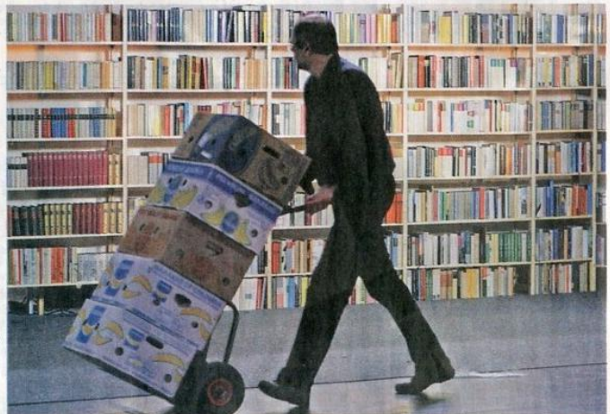
A man rolls boxes with antiquarian books past a shelf. The Antiquarian Book Fair at the ADIBF will bring together a range of leading and internationally renowned antiquarians, showcasing a collection of rare and valuable antique books, manuscripts and artefacts in multiple languages.